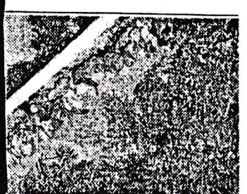
A Leaky Canvas Hose Seals

An amateur gardener with a garden hose practices irrigation just as truly as a farmer who irrigates field crops. Both should understand the behavior of water in the soil.